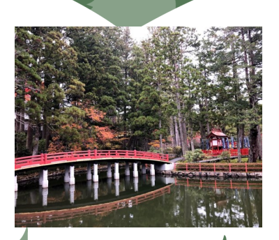
Put the caption for your photo here.